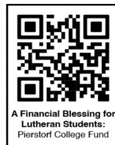
A Financial Blessing for Lutheran Students: Pierstorf College Fund

Follow us on Facebook and Instagram at Pierstorf College Fund for current updates. Scan the QR code to link directly to the application.